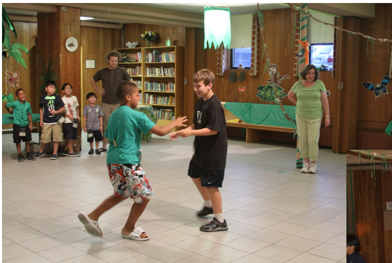
Playing games with a Jungle Safari theme!